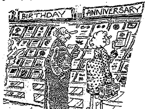
"Let's just hand each other one, read it, put it back and save ourselves five bucks."

BTA - Take the fox over, return with nothing. Go over with one chicken, return with the fox. Go over with the second chicken, return with nothing. Finally, take the fox over.