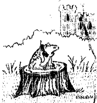
"The usual ... what? for a kiss."

First Place: USA Second Place: USSR Third Place: Hungary USA Performance: 40 Gold, 19 Silver, 17 Bronze