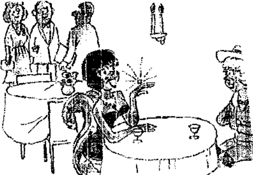
"Amazing, isn't it, how nature can produce a diamond just by taking a man and putting him under tremendous pressure?"

In connection with solar activity, NASA has new data on the radiation hazards involved in going to the moon and Mars. The Mars Science Laboratory delivered the Curiosity rover by traveling to Mars for 253 days. The first radiation detector to make the trip was on the spacecraft. Because the solar activity was low, scientists thought that radiation levels would not be prohibitively high. Even with these ideal conditions, a human going to Mars would get so much radiation that it would be like having a whole-body CT scan every five or six days. It would be like a Hiroshima survivor experiencing that event two dozen times. The dosage would be 66,240 mrem (millirems), which is what the average person on earth gets in 184 years. This amount of radiation would increase a fatal cancer risk by 3 or 4 percent. We fail to realize how much shielding is built into the earth's design by the atmosphere and the earth's magnetic field.