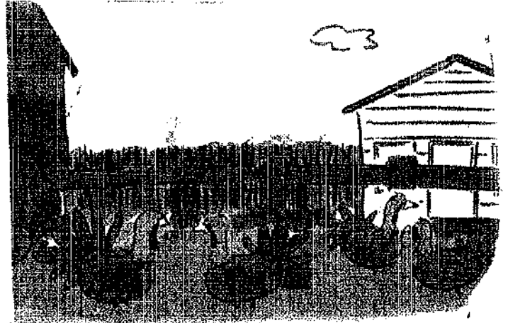
"What we need is a mad turkey disease!"

BTA - The word 'wrong'. Bible - Job - Jochbed Ex 6:20 - Sycamore Lake 19:4