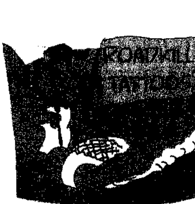
"Sweet the tracks. My mom is gonna freak!"

The New Madrid fault caused one of the largest earthquakes in U.S. history in late 1811. The quake was so severe that the Mississippi River ran backwards for several hours. Measurements made along the fault show that the stress levels have decreased substantially in the past several years. Doomsday articles keep appearing in a variety of periodicals saying that earthquakes are increasing and that the end of the earth as we know it is near. There is no question that some areas of the world will continue to have earthquakes, but the more we understand what causes these energies to be released the more we see they are just a natural.