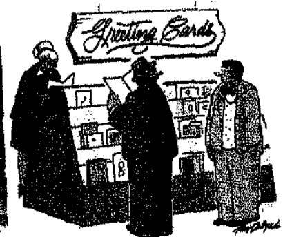
"I can't find one that my wife would believe."

BTA - Your right elbow. You can try it yourself if you're not convinced, but unless you have a broken arm or an incredibly flexible ulna, you won't reach it.